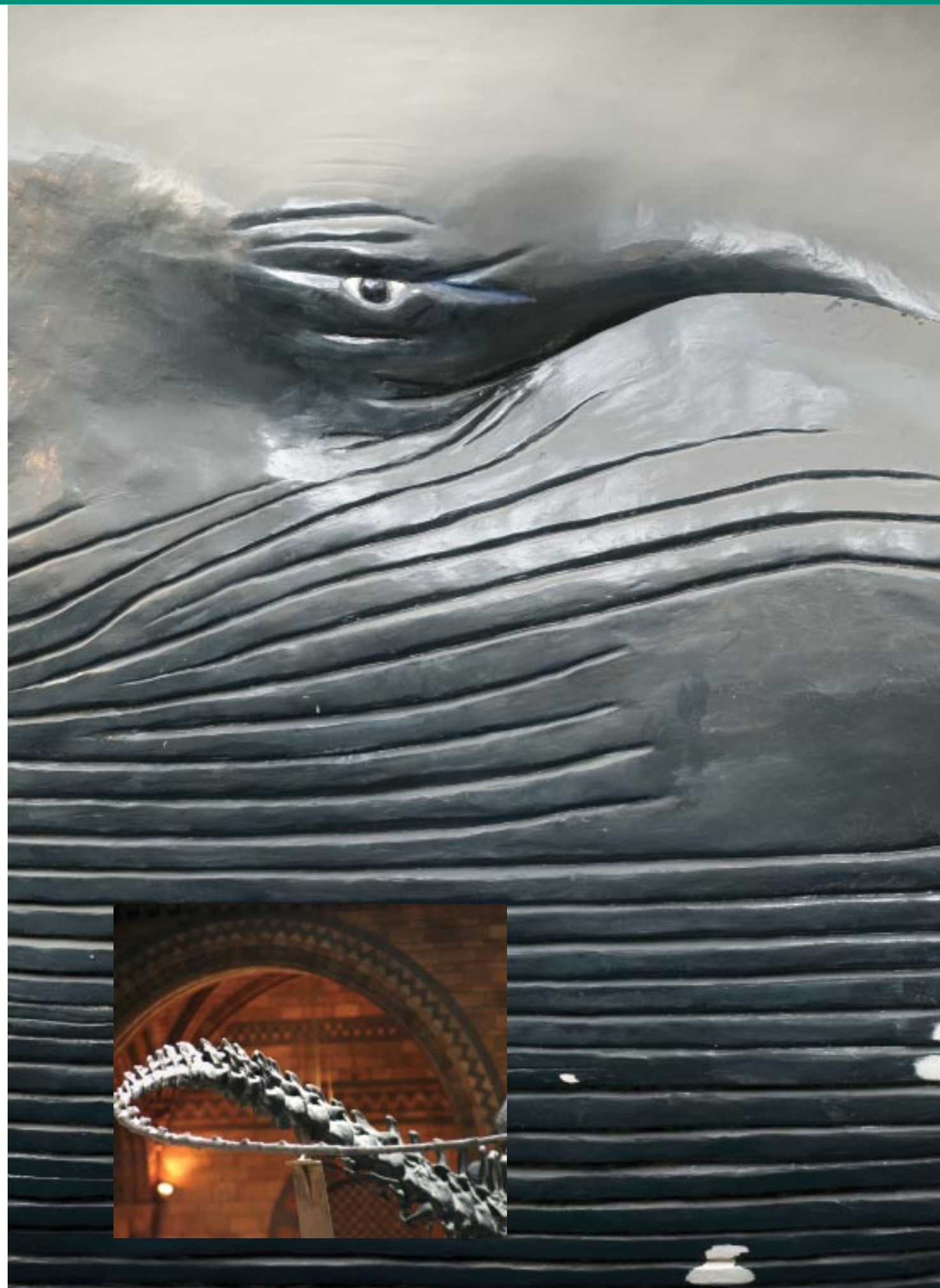
Above: Images courtesy of Natural History Museum