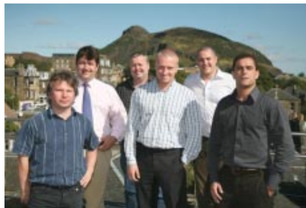
The National Library of Scotland Trusted Digital Repository Team

A digital sustainability policy has been developed and accepted in principle. This states that "The Natural History Museum is committed to ensuring that selected digital objects continue to be accessible into the indefinite future" and goes on to define the types of digital objects that will be preserved; how the selected digital objects will be preserved and who will be responsible for these preservation activities.