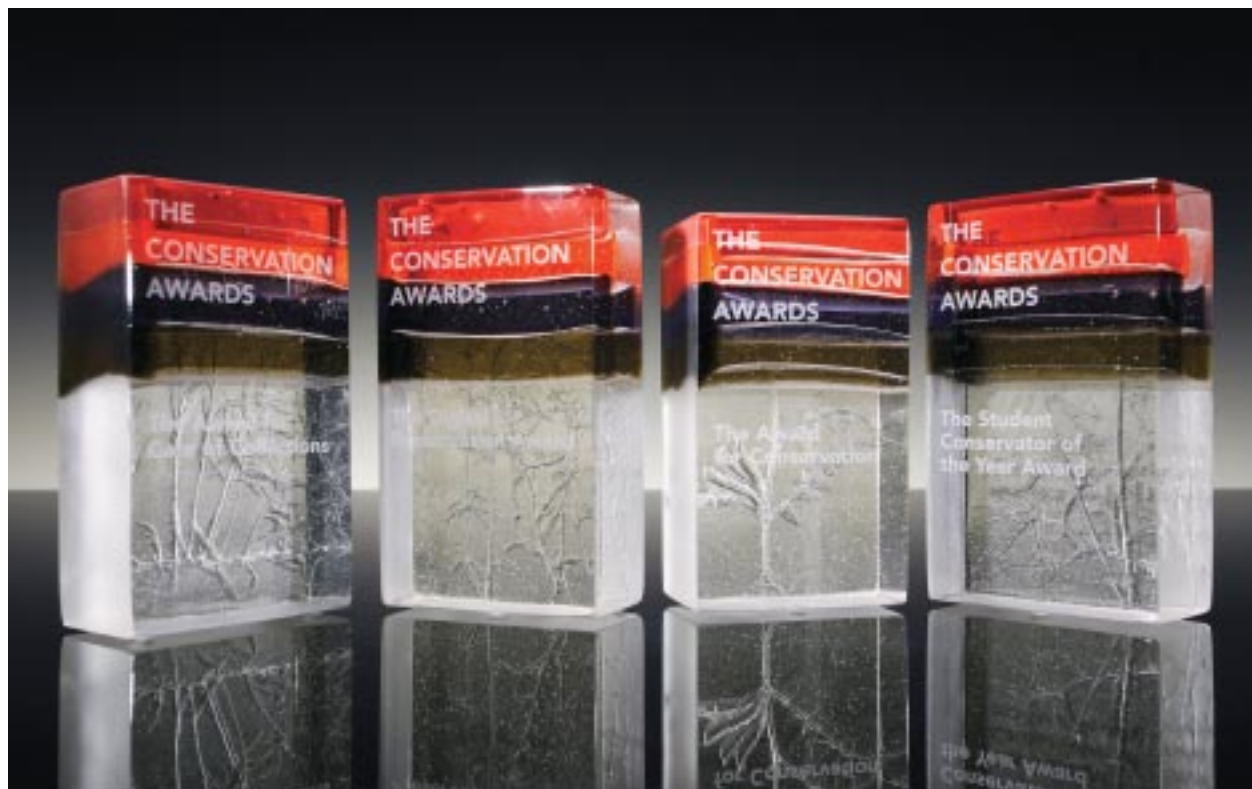
The Conservation Awards Trophies - second from the left; The Digital Preservation Award Trophy.

Special thanks go to our volunteer panel of Digital Preservation Judges who do an excellent and challenging job of short listing and selecting a winner from the high quality of entries.