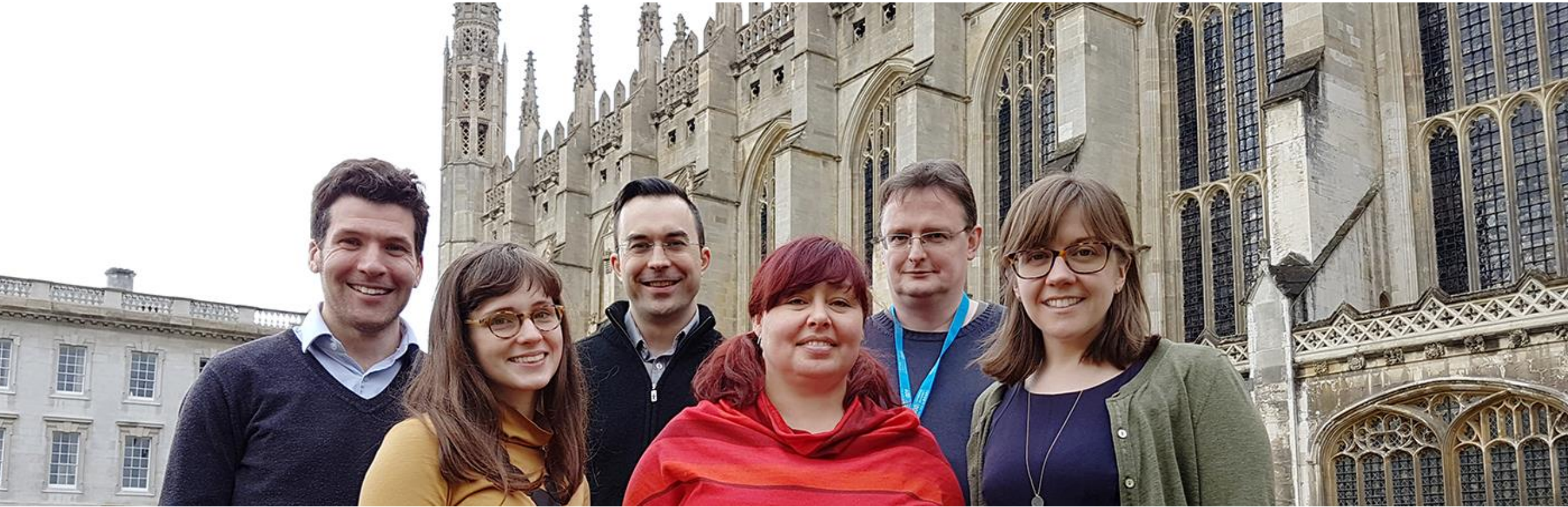
The Polonsky Digital Preservation Research Fellows