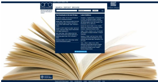
Oxford University Research Archive