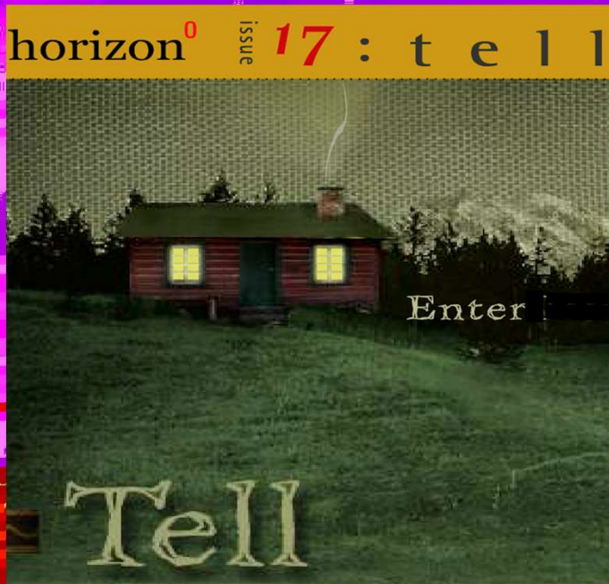
Horizon Zero 17: Tell - Aboriginal Storytelling (2004)