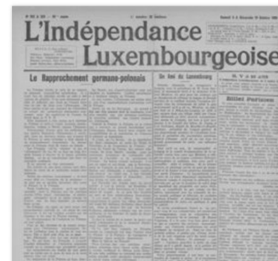
Indépendance luxembourgeoise (L')