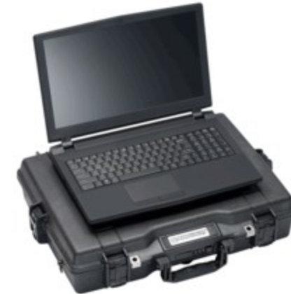
FRED L Forensic Laptop $7,324.00