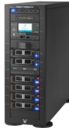
FRED Forensic Workstation $6,899.00