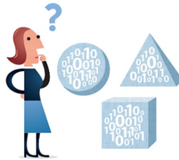
Illustration by Jørgen Stamp digitalbevaring.dk CC BY 2.5 Denmark

*Useful for digital preservation practitioner, not other users