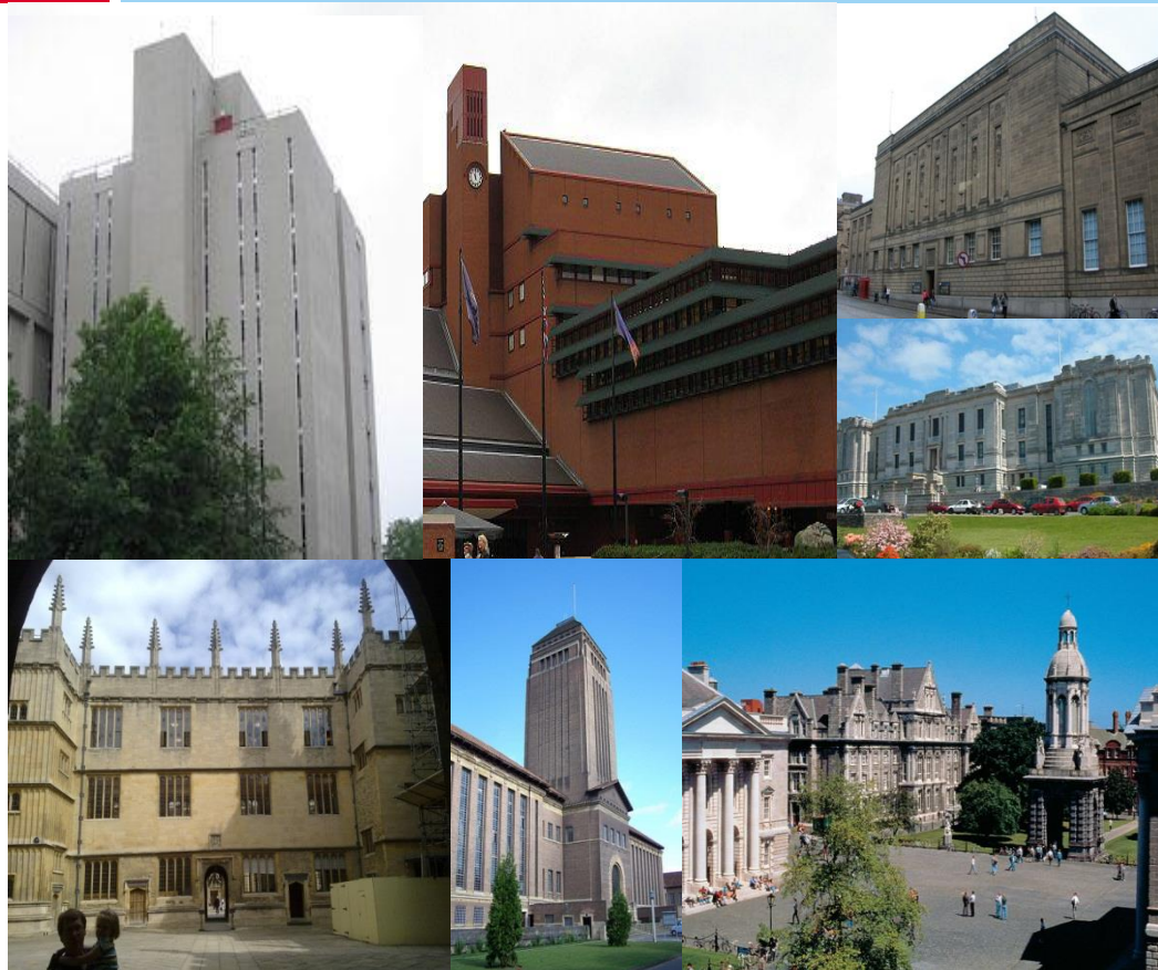
The British Library