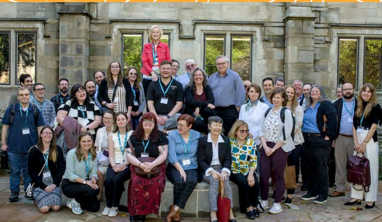
The DPC is a welcoming and inclusive global community, working together to bring about a sustainable future for our digital assets.