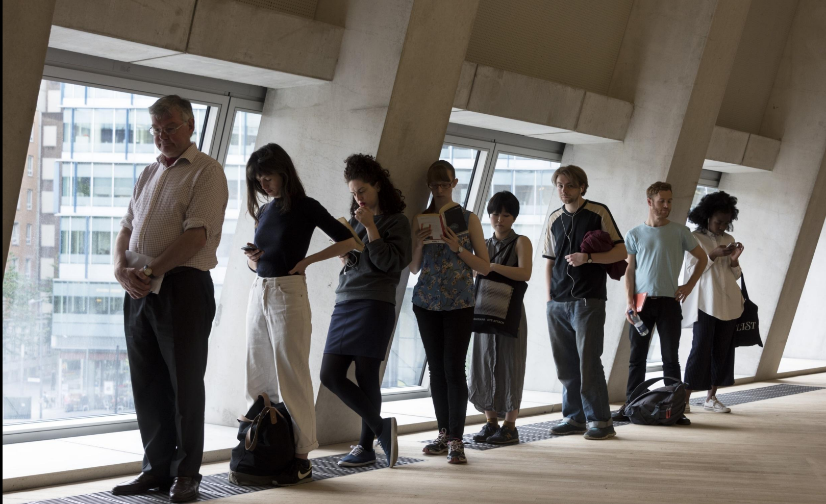
Good Feelings in Good Times (2003) by Roman Ondák (T11940) © The artist