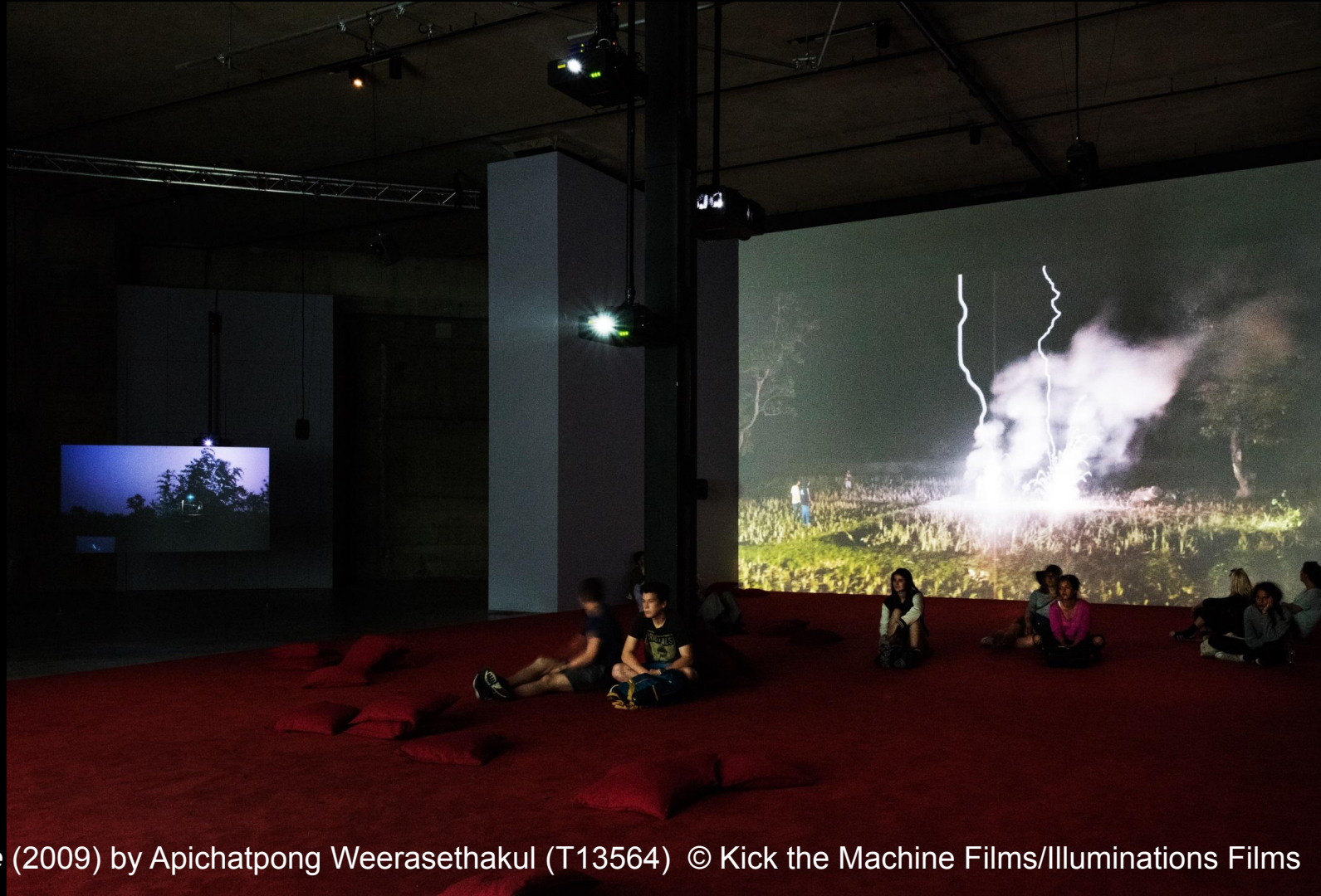
Primitive (2009) by Apichatpong Weerasethakul (T13564) © Kick the Machine Films/Illuminations Films