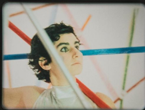
Birds (2001) by Daria Martin (T12743) © The artist