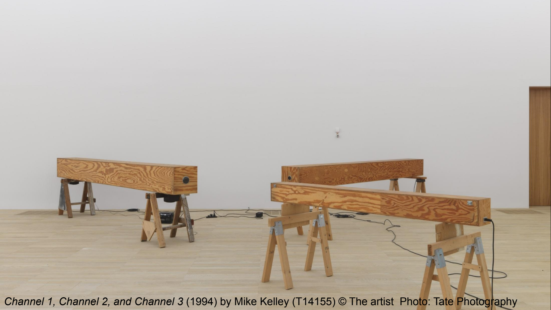
Channel 1, Channel 2, and Channel 3 (1994) by Mike Kelley (T14155) © The artist Photo: Tate Photography