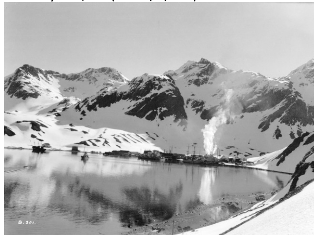
View of Grytviken, 1936 (Ref P51 / 8 / B201)

The project fitted easily with of SPRI's Museum Libraries and Archives strategy with its focus on preservation, widening access and education. This strategic fit has given added support to the project. The staff and management of SPRI demonstrated a great commitment to this project as well as an understanding that digital preservation and access were equally as important to this project and that the two are interconnected. SPRI recognized that enhanced access to their collections through digitization will only improve long term access if the digital surrogates are carefully maintained in an appropriate environment.